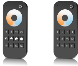
RT2 1 Zone CCT

1 and 4 zone CCT/Touch color wheel/Wireless remote 30m distance/AAAx2 battery/Magnet stuck fix